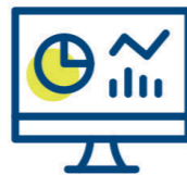
Statistics and Data Analysis