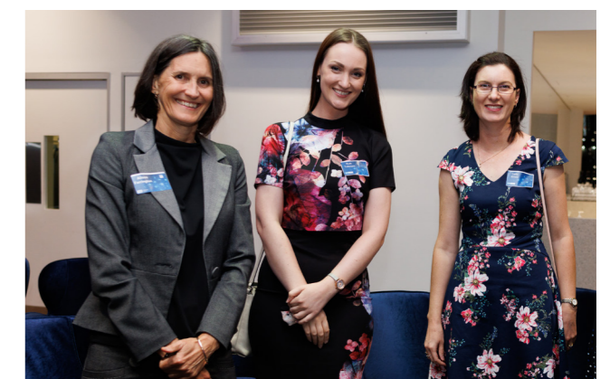
Guests and staff enjoying the Australian Centre for Health Services Innovation’s 10th Birthday Celebrations

AusHSI’s 10th anniversary celebration on 3 November was held in conjunction with the launch of QUT Faculty of Health’s new Real Health Lecture Series.