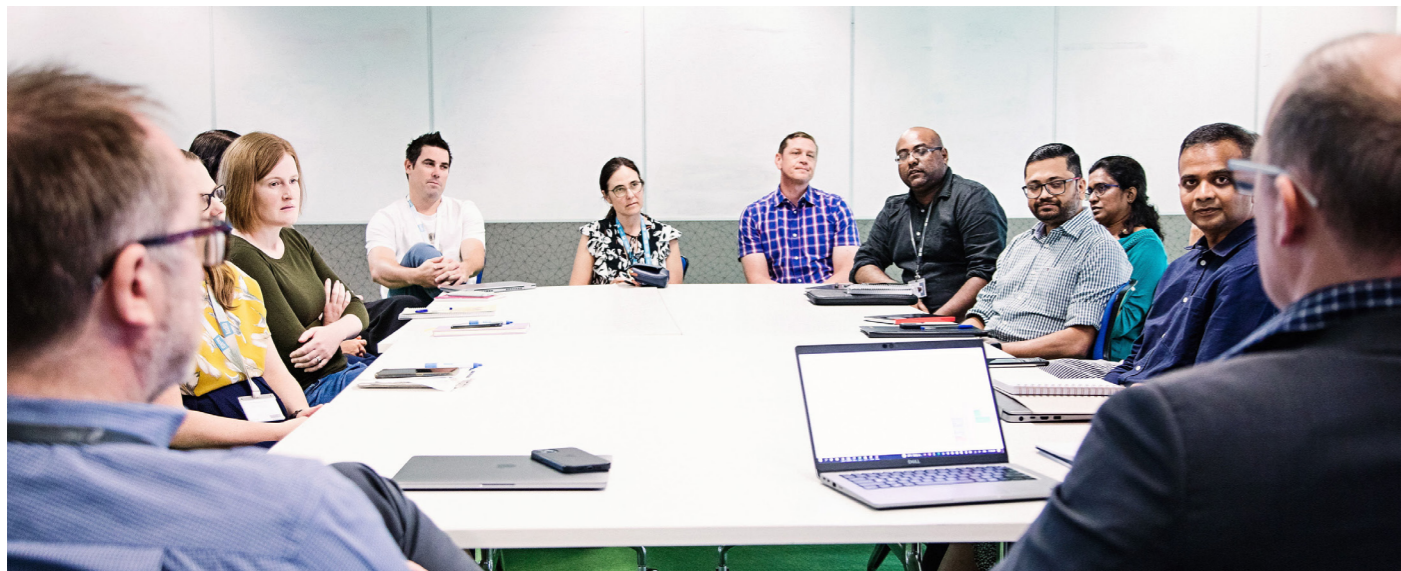
IMAGES: AusHSI Higher Degree Research Students (TOP) and AusHSI Staff (MIDDLE and BOTTOM)